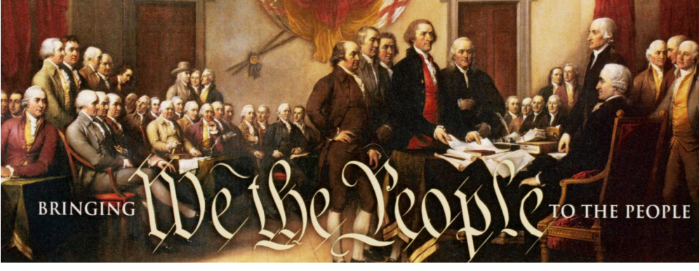
The American Constitution Spirit Foundation